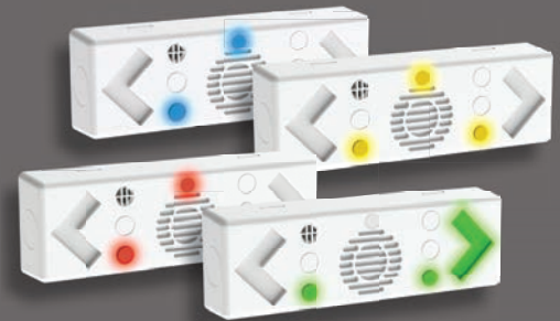
Intelligent Supplemental Exit Signs