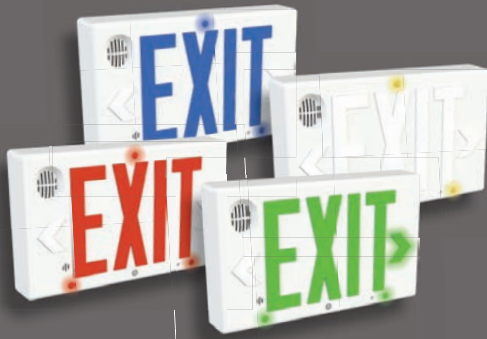
Intelligent Exit Signs

FEATURING NEXT GENERATION AI THREAT IDENTIFICATION